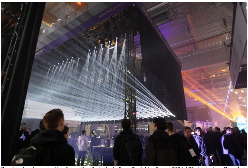
Spectacular shows and hustle and bustle in the halls at Prolight + Sound 2024

Finally, the PLS Community Nights with popular DJs bridged the gap between the exhibition centre and the city. Prolight + Sound was a guest at 'Friedas Bar & Kitchen' in the Omniturm, the 'NEUE KAISER' and the 'Champions Frankfurt'. The icing on the cake: The presentation of the 'Opus - German Stage Award' and the 'Sinus - Systems Integration Award' - this time as a red carpet event at the Steigenberger Icon Frankfurter Hof.