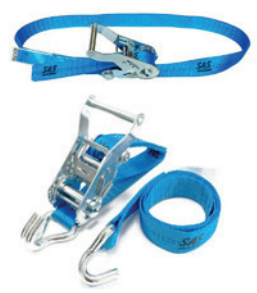
Fig. 6

Lashing straps are suitable for additional fastening. These are available in different versions and from different manufacturers.