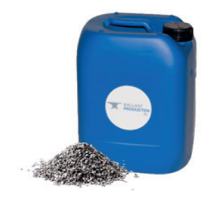
Fig. 3